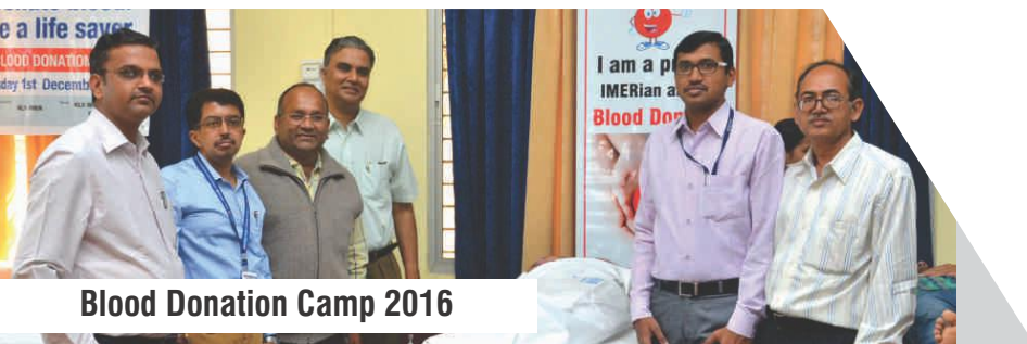
Blood Donation Camp 2016

We try to develop our students as good citizens with a sense of social responsibility. In this direction we conduct several community outreach programs like blood donation camp, tree planting, sapling distribution, voting awareness, etc.