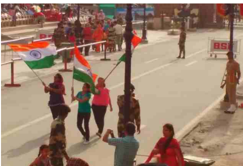
National Tour to Wagah Border

The concept of English immersion classes has been introduced for the students. We have appointed eminent English teachers to conduct English immersion classes on a daily basis. These classes are offered at no extra cost to our students.