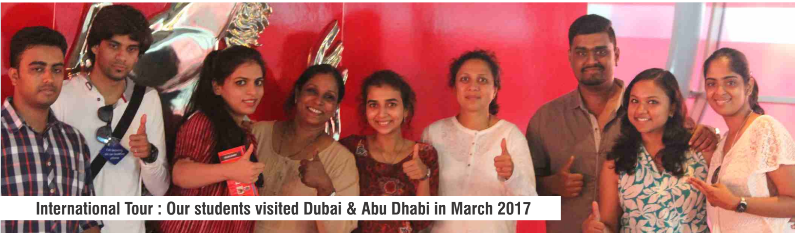
International Tour : Our students visited Dubai & Abu Dhabi in March 2017