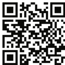
Old Question Papers