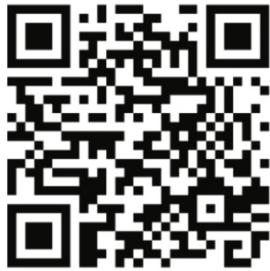
Syllabus Copy (1st Semester)

To link for Important Library e-Resources (Login to our IMER internet)