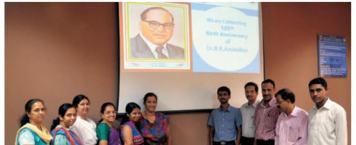
14/04/2016 : Dr. B. R. Ambedkar Jayanti