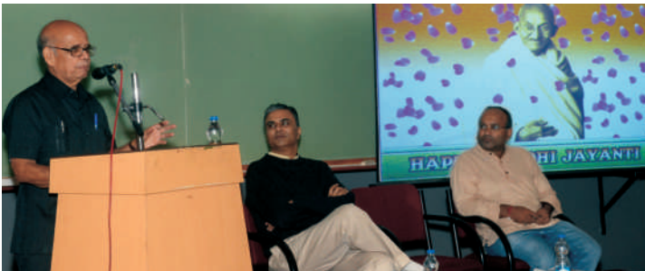
02/10/2015 : Gandhi Jayanti