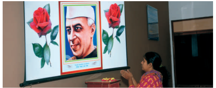
14/11/2015 : Children's Day