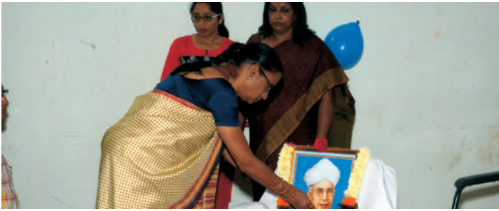
05/09/2015 : Teacher's Day