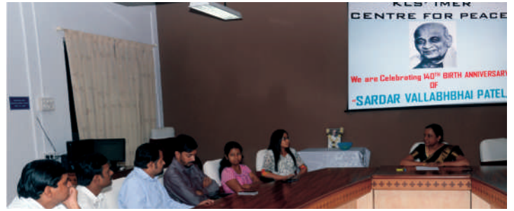
31/10/2015 : Sardar Vallabhbhai Patel Jayanti