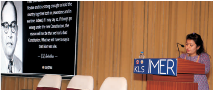
26/11/2015 : Constitution Day