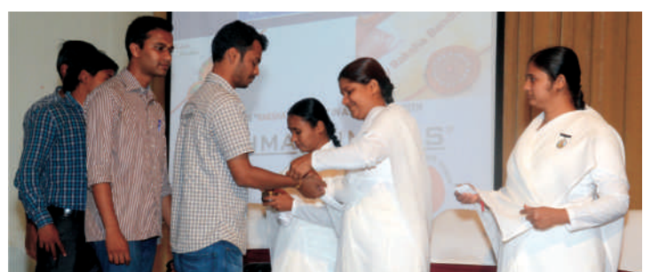
31/08/2015 : Raksha Bandhan